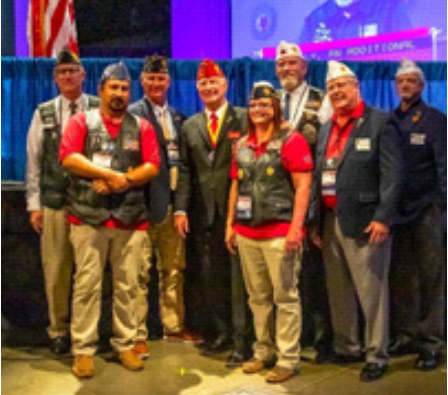
National Convention Milwaukee, Wisconsin

Setting up for Post 64 American Legion Riders 1st Annual Bike Show. 9/17/2022