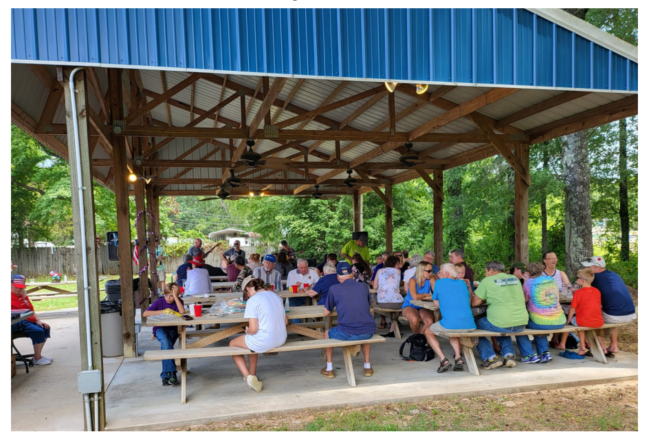
LOTS OF GOOD FOOD, MUSIC, FUN, GAMES AND COMRADERY AT THE ANNUAL 4TH OF JULY PICNIC.